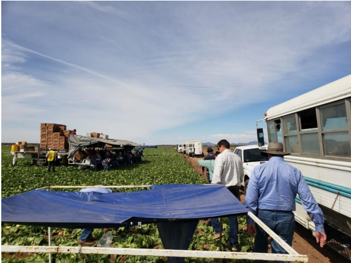
The ICA Commissioners touring Mellon Farms

Early the next morning the ICA Commissioners and the Director made their way down to the border to visit the San Luis Port of Entry which processes thousands of people a day, many who are coming into Yuma to work in the agricultural industry for the day.