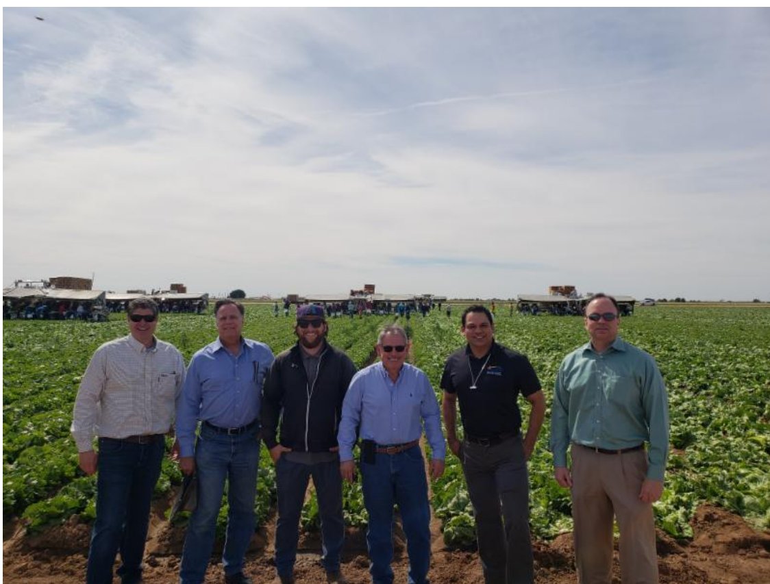
The ICA Commission touring Mellon Farms

The day was rounded out at a lunch meeting with stakeholders and a public Commission meeting held at the Yuma City Council Chamber.