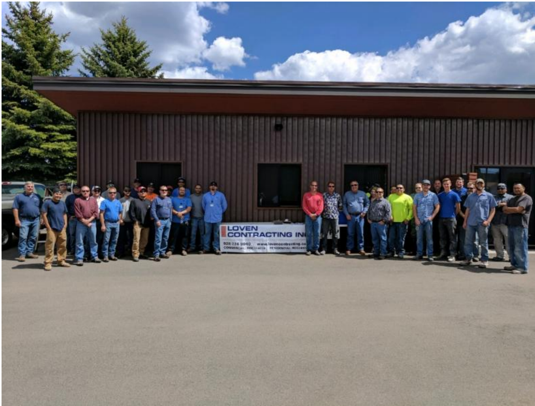
Loven Contracting visit

ADOSH operates consultation programs for public entities and private companies. If you or someone you know is looking to lower workers' compensation costs and increase productivity by implementing a safety program, contact our offices. ADOSH operates our consultation programs confidentially and at no cost. Contact ADOSH today at comments@azdosh.gov or call 602-542-1769.